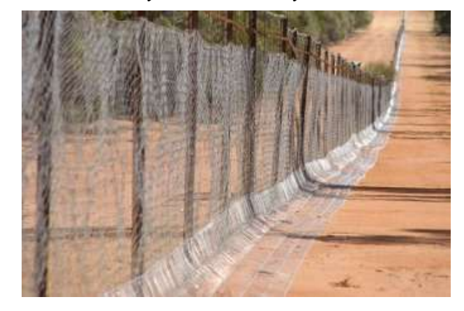
PHOTO: A proposal for a 1,400 kilometre wild dog exclusion fence is being put to western Queensland communities.

The Remote Area Planning and Development (RAPAD) board and the Central West Wild Dog Control Fence Committee, have spent the last two years debating whether small clusters of fencing, or an overarching 1,400-kilometre, multi-shire check fence should be funded.